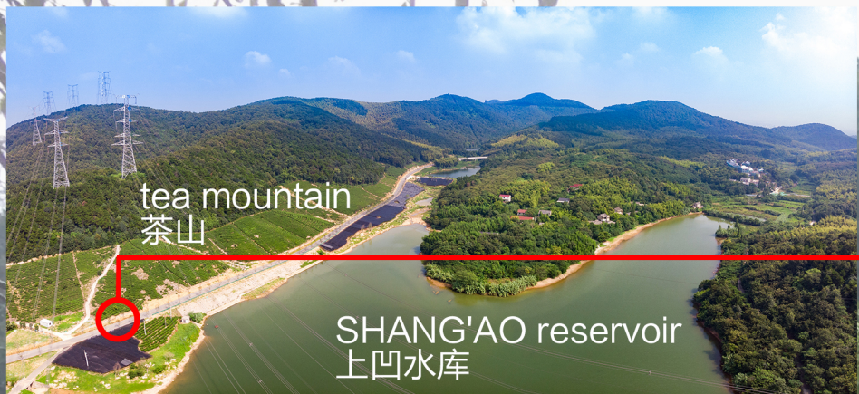
tea mountain 茶山