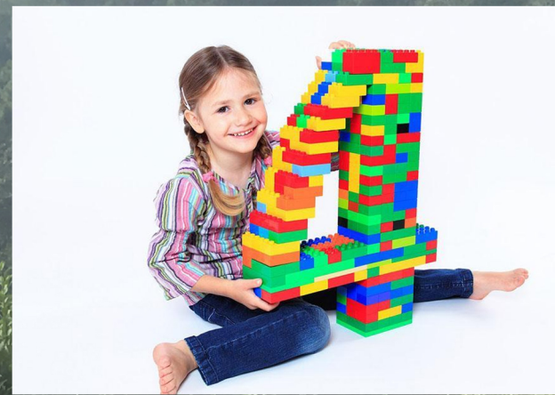
用孩子的方式解决问题 Solve the problem like children