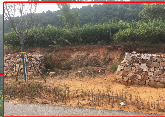
发现问题 围挡的断裂 Find the problem There is a break